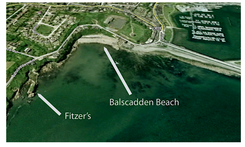
that is situated within a walk of Howth village.